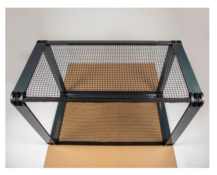
Set the other side of the table on its place.