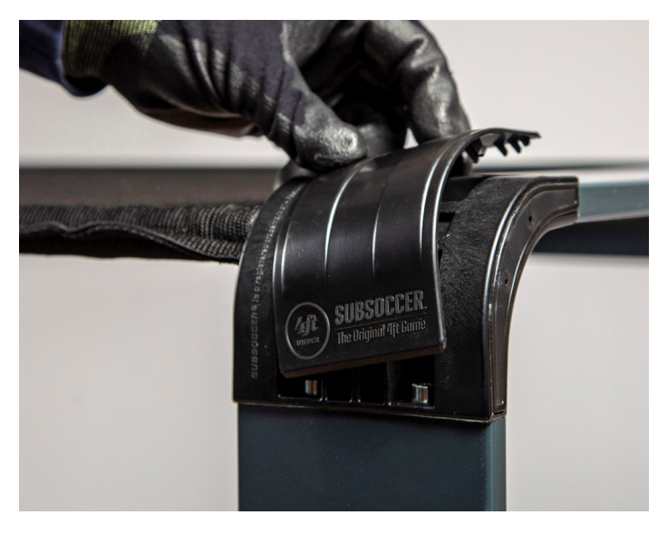
Tighten up all the screws. Place the cover plates- and caps on every corner.