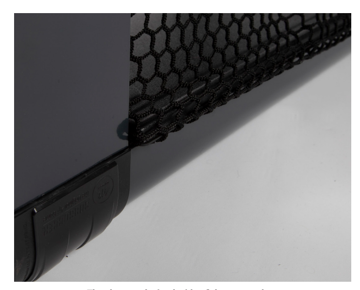
The slots on the back side of the return plate has to go over the aluminium profile.