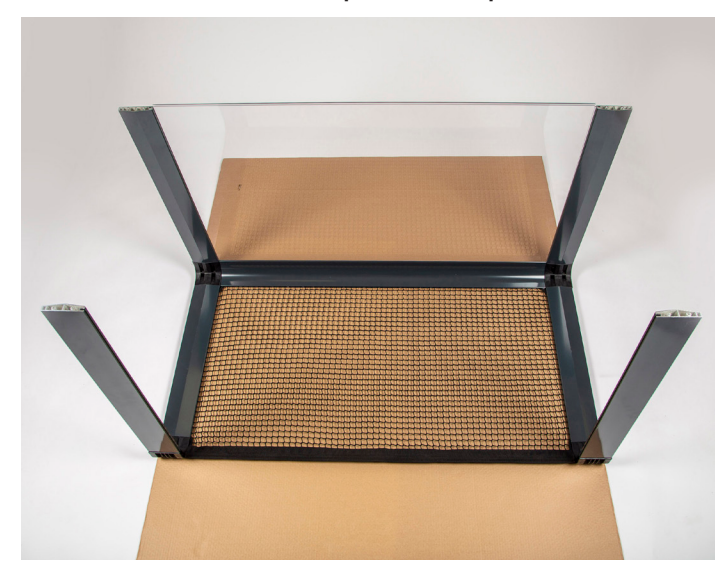
Slide a transparent cover plate on its place.