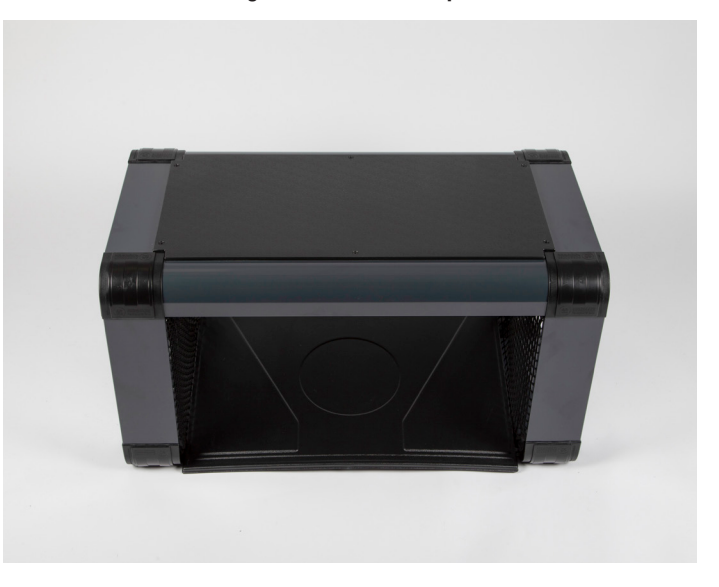
The seat/goal is ready.