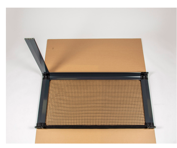
Take one side of the table and set the aluminum profiles on their places.