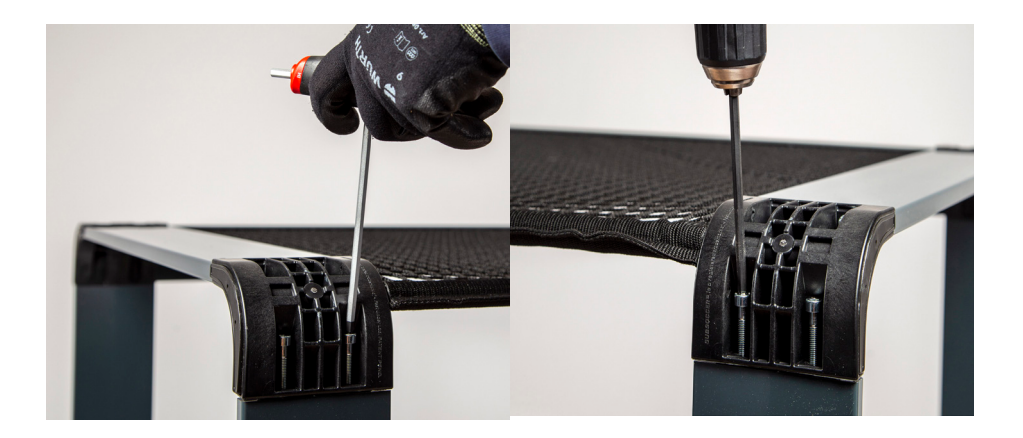
Tighten up all the screws. Place the cover plates- and caps on every corner.