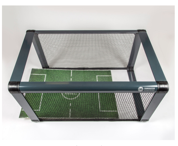
Slide the game mat (package 3.) inside the frame.